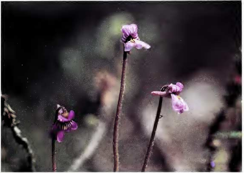
P. villosa at Angela Lake—close up of flowers.